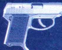
.380 DAO BACKUP