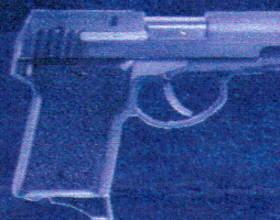
.45 DAO COMBAT MODEL BACKUP

Available in a variety of calibers from .380ACP to .45ACP, there's an AMT stainless steel backup to suit every style and budget.