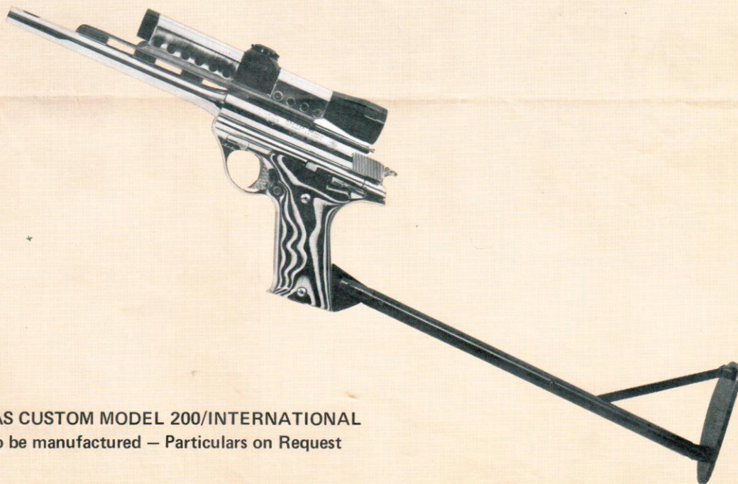
L. E. JURRAS CUSTOM MODEL 200/INTERNATIONAL Only 25 to be manufactured — Particulars on Request

Standard Auto Mag, 357/ or 44 with JURRAS custom tune-up and domestic laminated wood grips. Includes "Pancake" holster, tuned spare magazine and magazine pouch. $785.00